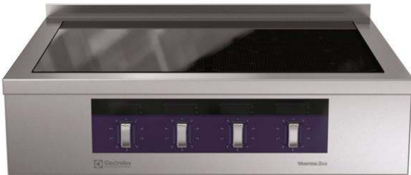
588016 (MACDABHOAO) Infrared Top, 4 zones, one-side operated with backsplash